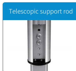
Telescopic support rod